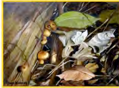
"Mushroom People" Painted in Acrylic